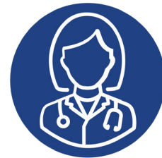
At-Risk Providers and ACOs

The Adhere Platform provides a technology-enabled, end-to-end medication adherence solution that supports our clients in achieving the Quintuple Aim of Healthcare.