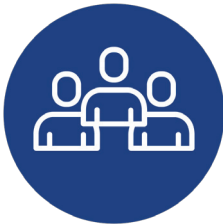
Managed Care Organizations