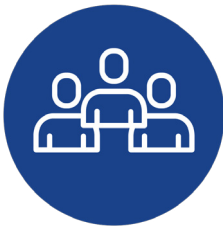
Managed Care Organizations