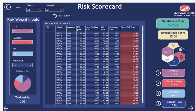
Exportable target lists, filterable by strategic priority